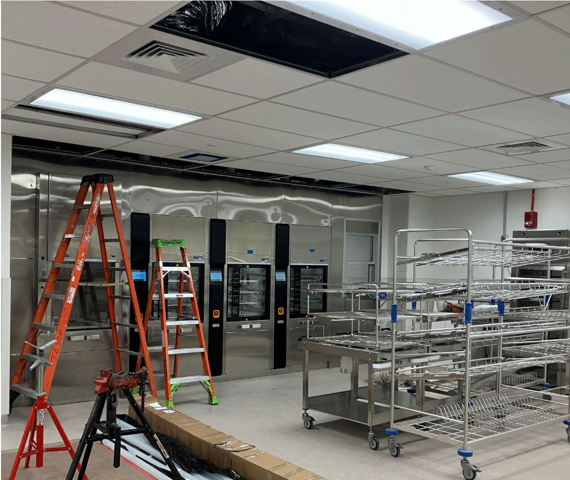
New Surgical Instrument Washers