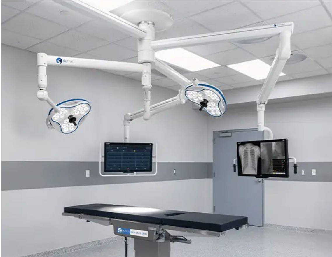
Conceptual Operating Room Image