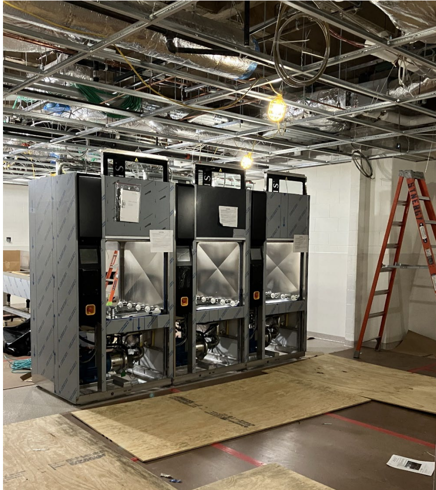
New Surgical Instrument Washers