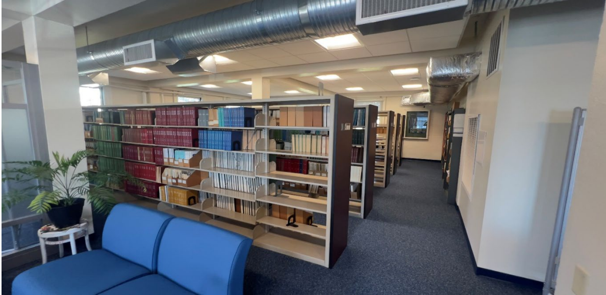
New Office Location