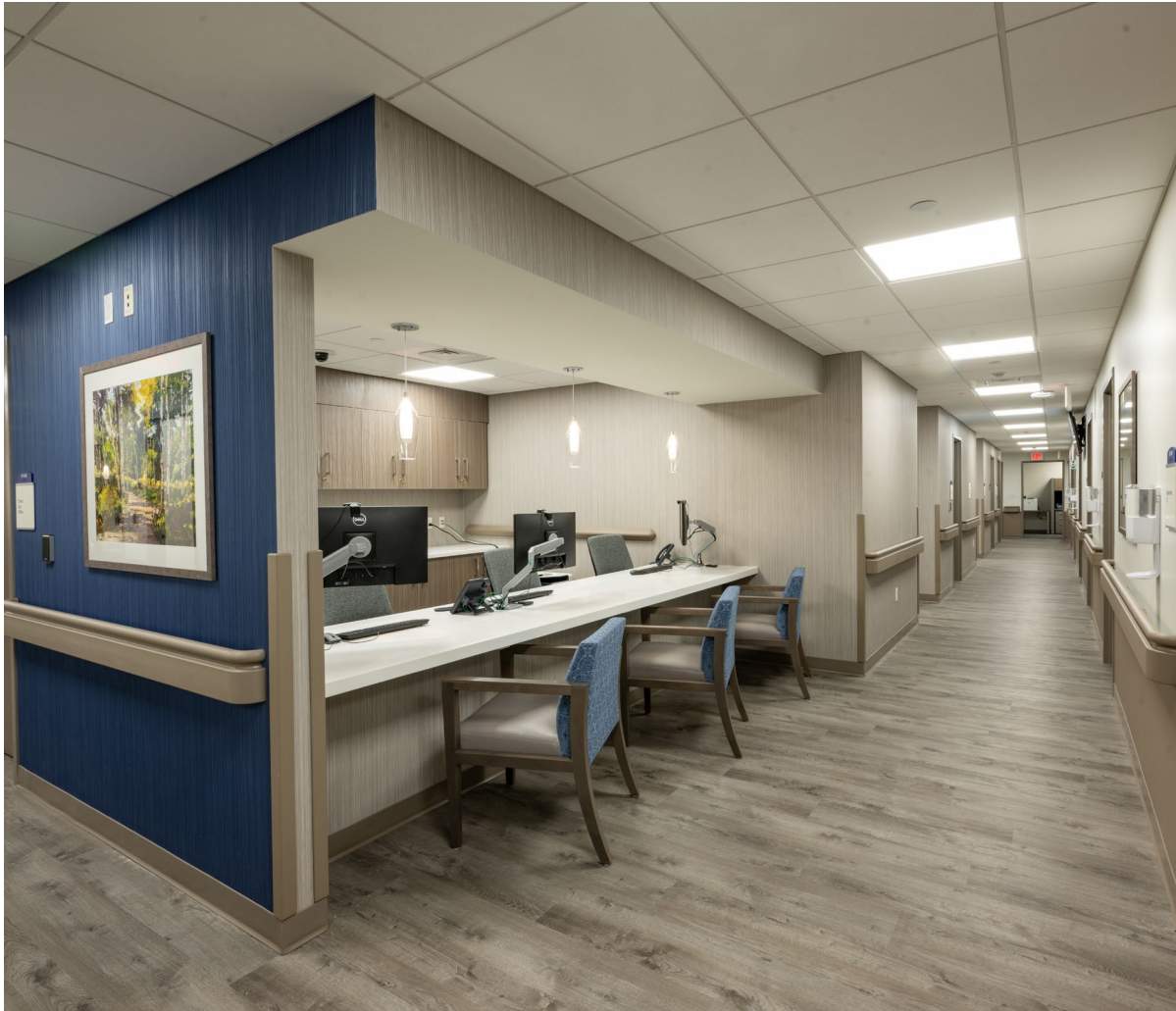
Example Clinical Fit-Out Concept