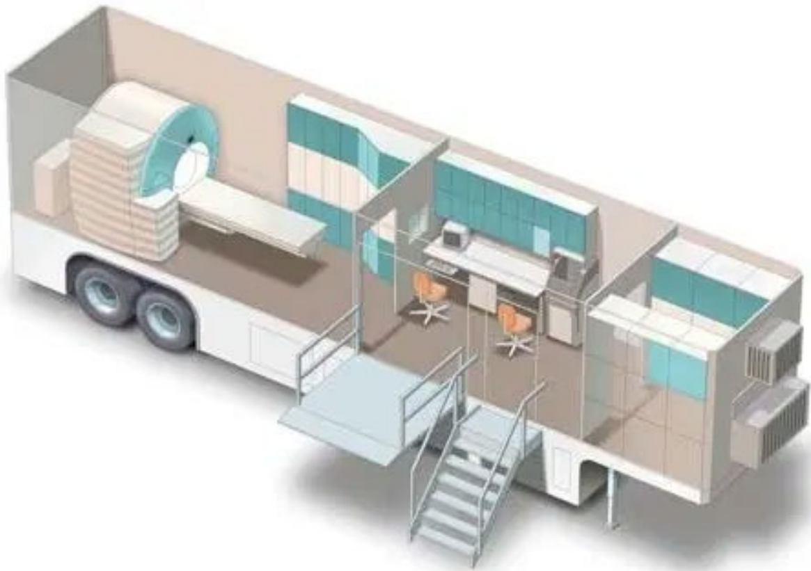
MRI Trailer Diagram