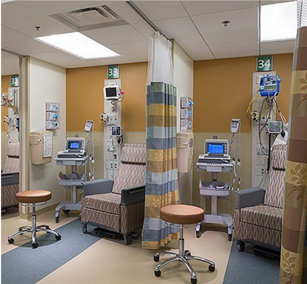
Low Acuity Treatment Area Example Concept