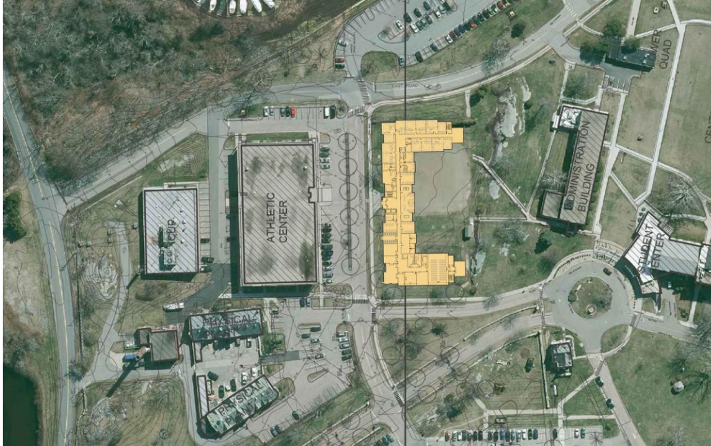
Schematic of Potential Residence Hall & Dining Facility