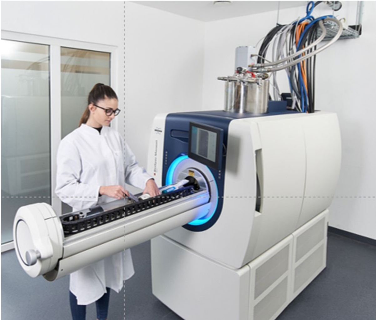
Example Research MRI Unit