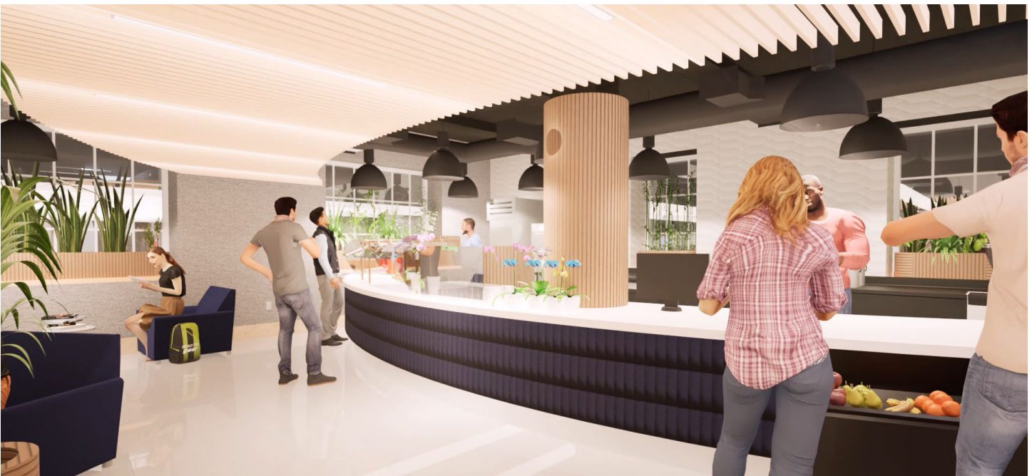
Rendering of new café area with food prep, display, and transaction counters.