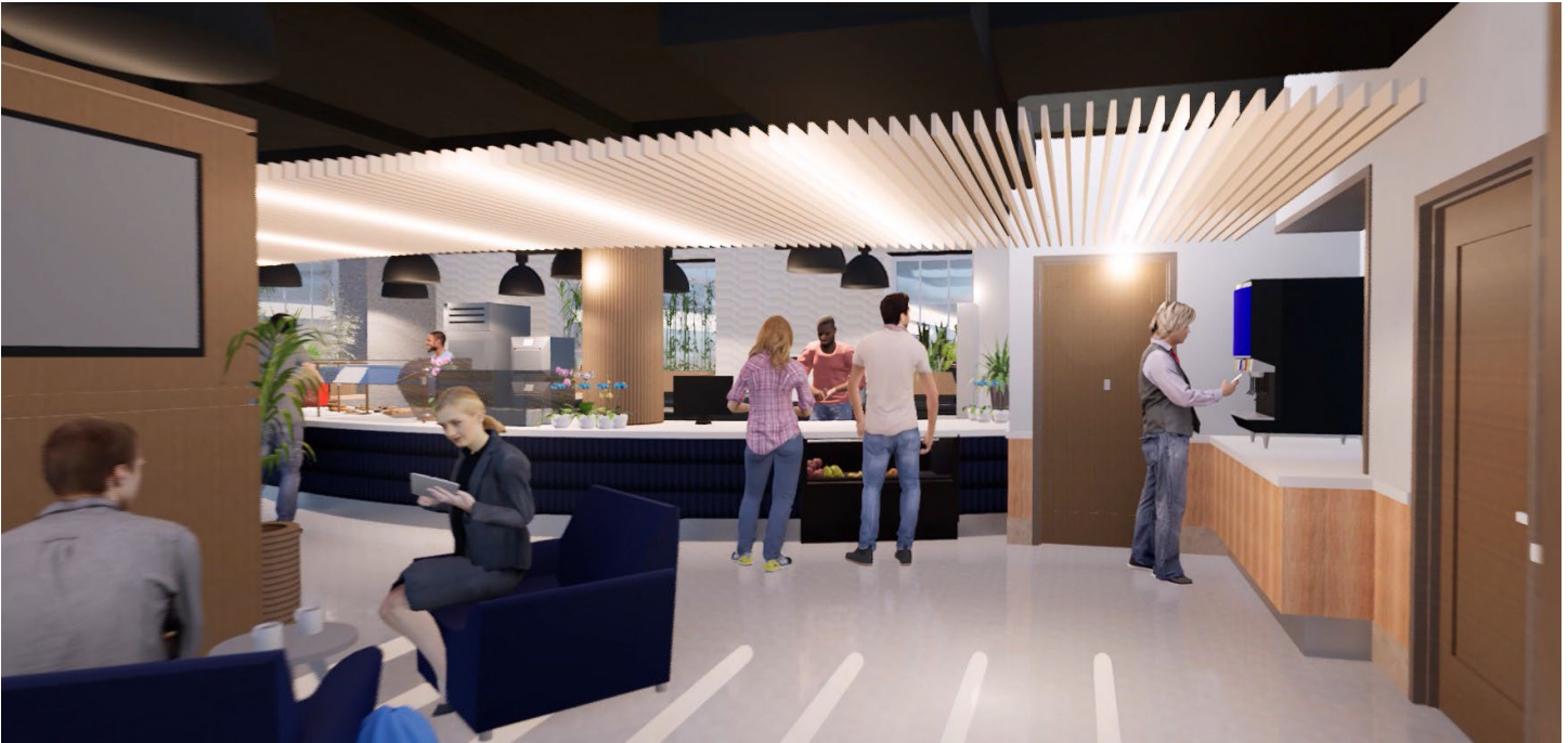
Rendering of new café area with food prep, display, and transaction counters.