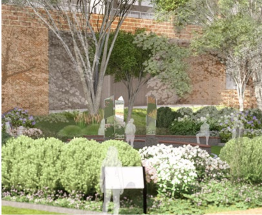
Site plan and view into Garden