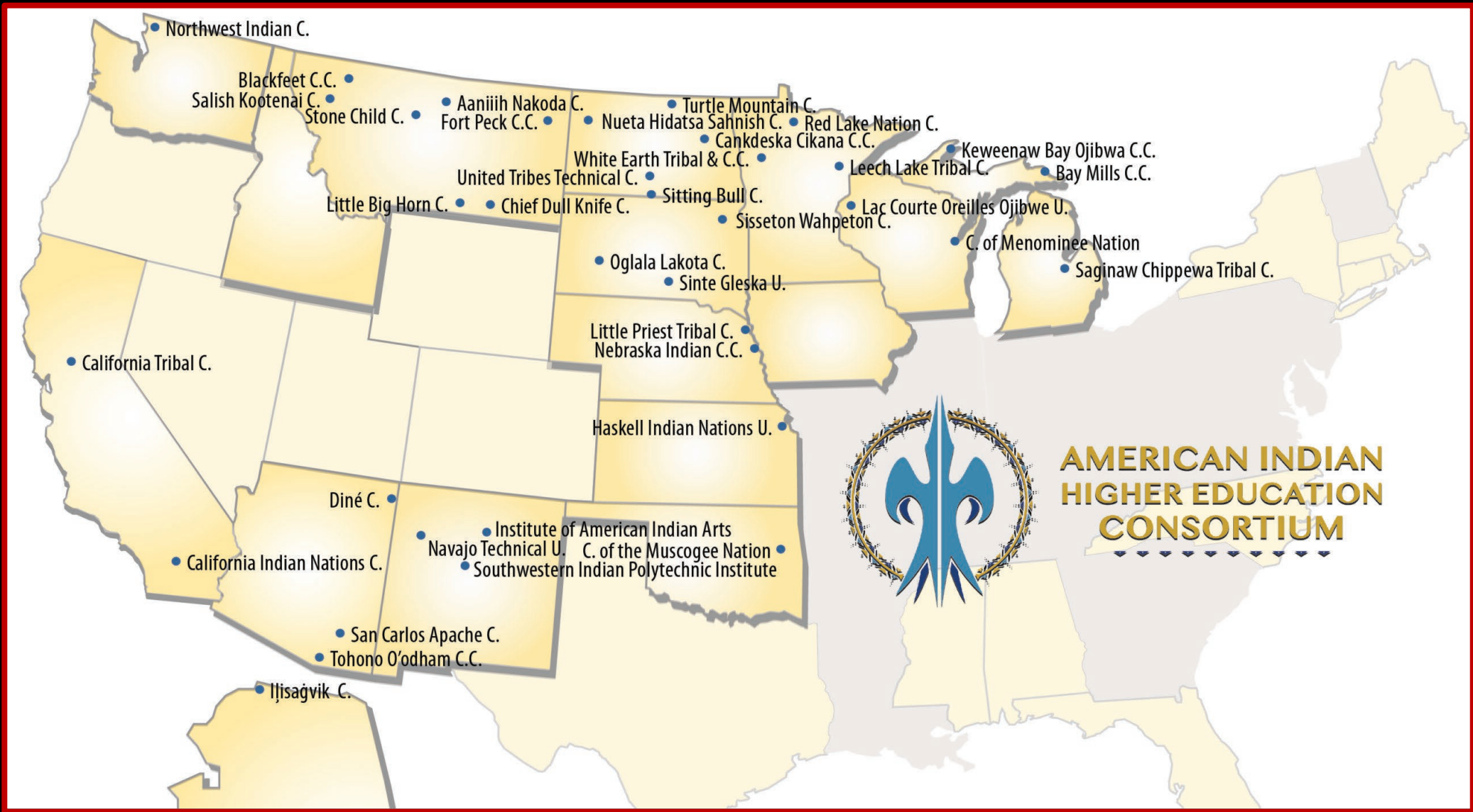
Tribal Colleges and University's (TCUs) in the U.S.