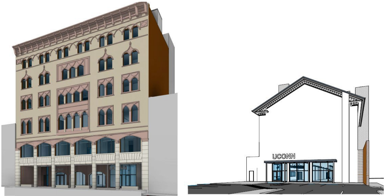
North and South Exterior Elevations