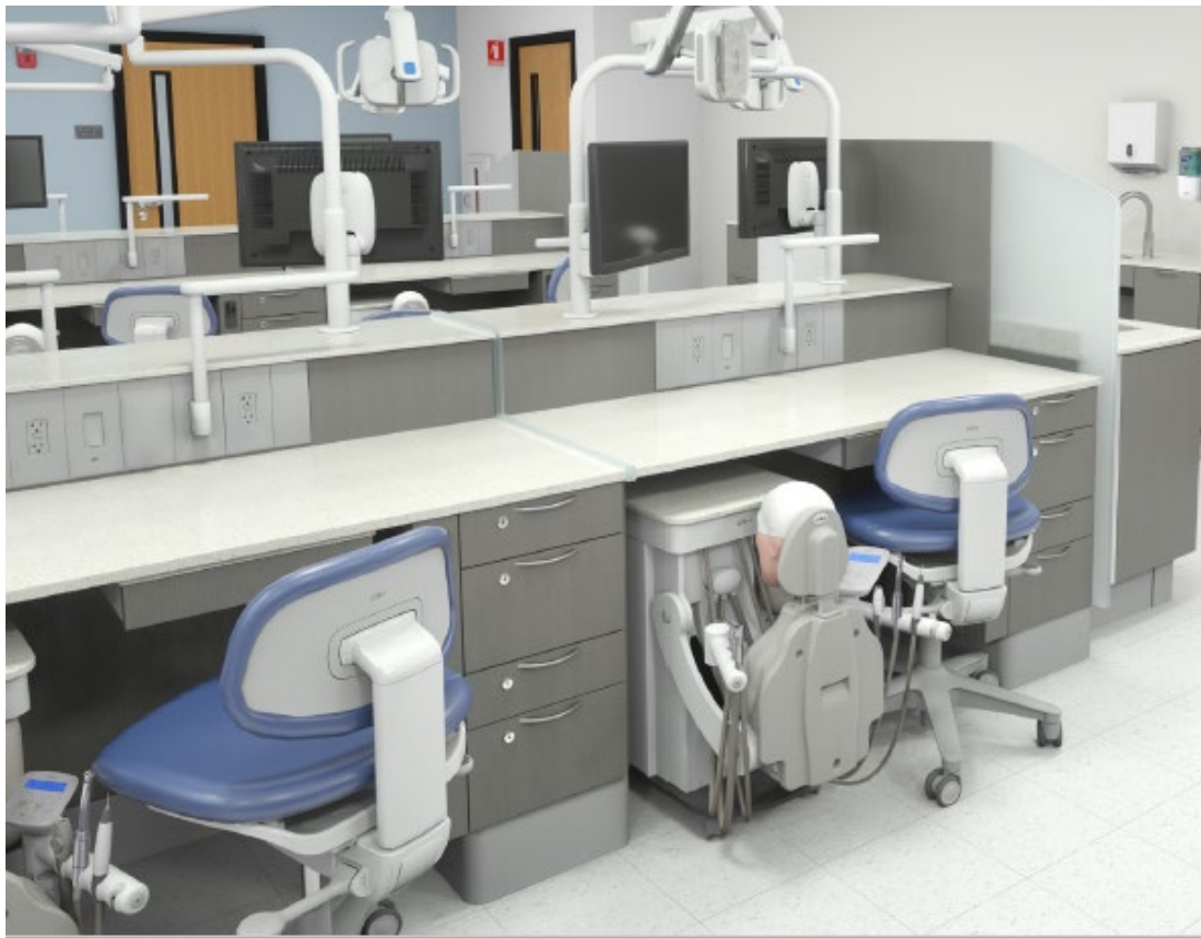
Dental Lab Concept