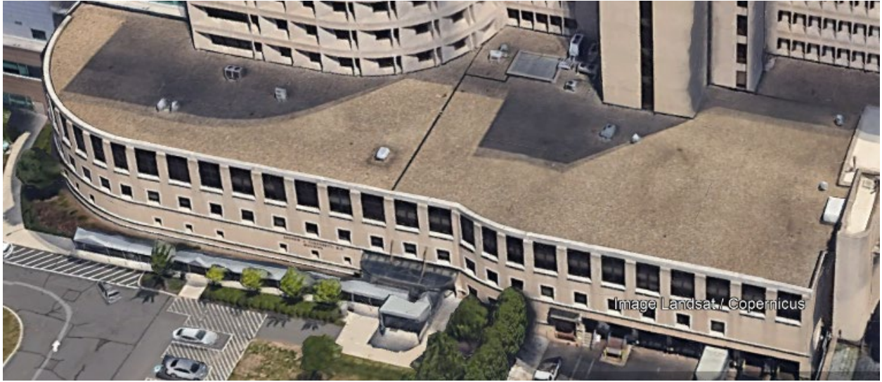
BUILDING F (CANZONETTI BUILDING) ROOF