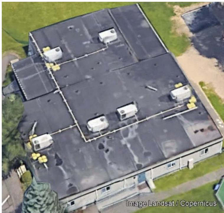
BUILDING M (DAYCARE CENTER) ROOF