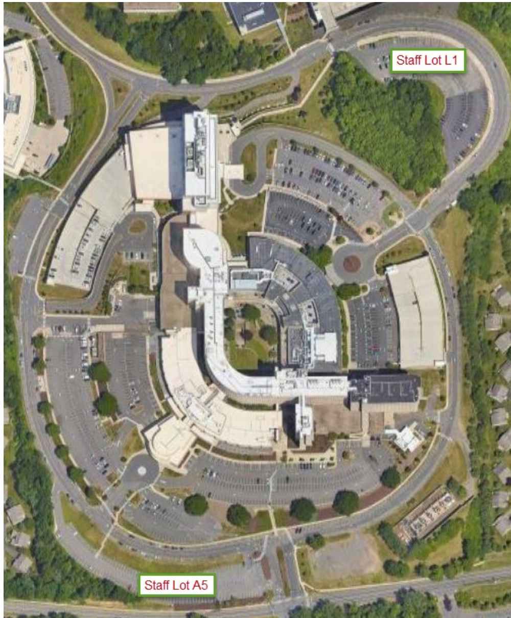
AERIAL VIEW OF PARKING LOTS